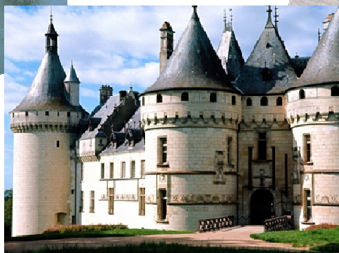
CHAUMONT SUR LOIRE