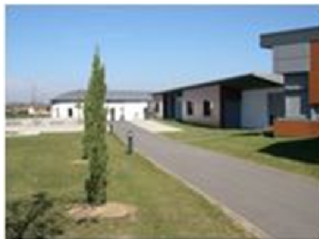
Groupe Scolaire Les Girards