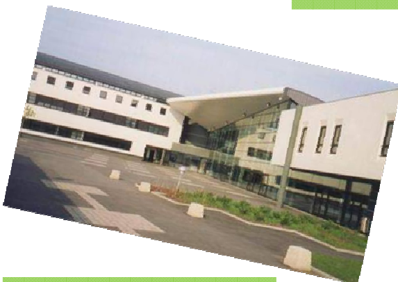
College Marcel Carné