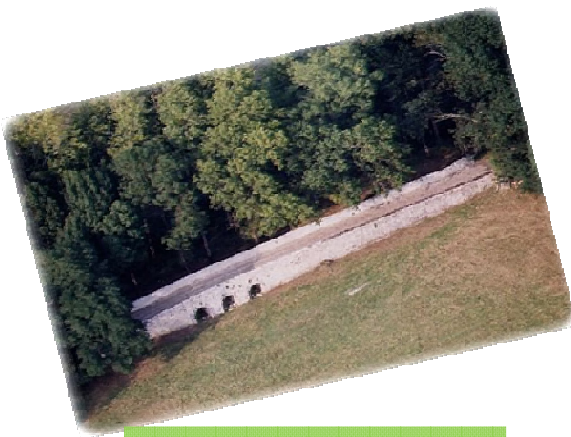
The Ponds Chartrains

For preschools and first schools, young children's schooling is provided by two groups, the Girards and the Noels School groups. Secondary education is provided by Marcel Carné Middle School. In addition to these public schools, Notre Dame private school (first and middle school) provides an alternative. In Vineuil, a total of 811 children are attending school in either a preschool or a first school and 810 more children are attending one of either middle schools.