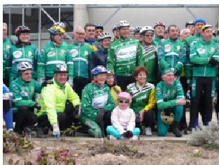
Vineuil Sports Cycling