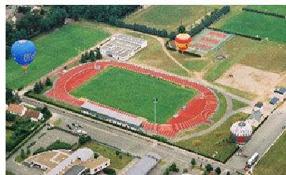
Sports Complex Vineuil