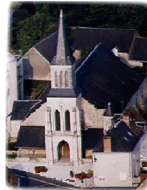
St Martin Church