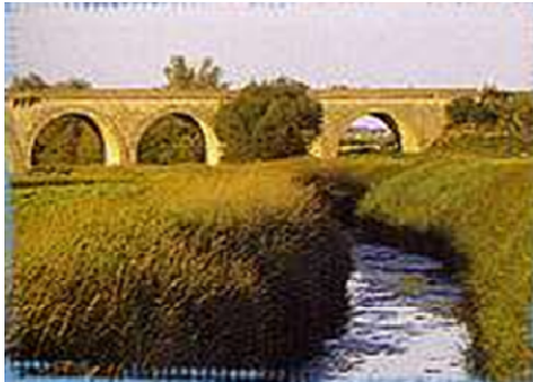
Old Railway Bridge

plateau devoted to agriculture. The Southern part of the municipality's territory is covered by the state Russy forest (374 ha or 924 acres). The camping site of the Lac de Loire, with its 140 ha stretch of water is settled in the Loire's plain. This water-based activity centre welcomes campers and offers various activities such as kayaking, sailing, windsurfing, water-ski, and a playground for children. A bar-restaurant also provides drinks and snacks.