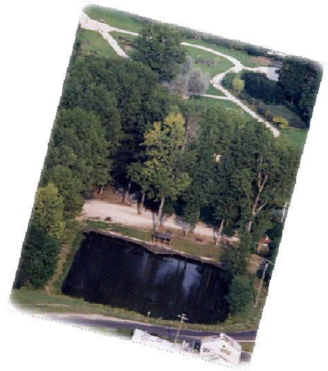
The Pit and The Square Park Feuillarde